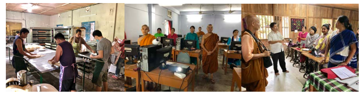
the bakery, computer training and sewing. We are hoping the government will approve plumbing and electricity soon.

We visited the 3 pilot Tech College projects. The building (offered by the government) should be finished next year but so far permission has only been granted for